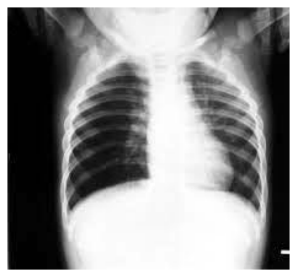
Fig. 1: Chest X-ray of foreign body aspiration.

If the child cooperates, an anteroposterior expiratory radiograph may reveal trapped air in the affected portion of the lung. In those children who cannot cooperate with the manoeuvre, lateral decubitus radiographs may reveal the trapped air. An anteroposterior film with compression on the abdomen, mimicking a forced exhalation, can be helpful.